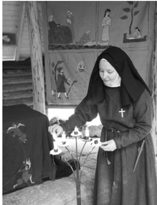
Sacrist in her church.

rian church music and had meetings about finances and other issues. The choice of nunnery as the setting made it obvious that majority of the characters would be women. But more importantly, they were also women governed by women - the abbess, the prioress, and the other office holders of the monastery. There were some priests whose role was confined to taking confessions from the sisters and holding the canonical offices. But although they had spiritual power over the nuns, they could not govern, only advise. Daily life in a monastery revolves for the most part around mundane issues of economy, human relations, and daily chores. Managing these affairs is the domain of the office holders (the cellarer, the sacrist, etc.) who are chosen from among the sisters.